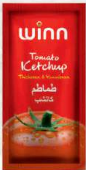
Weight - 9g Type - Sachet

Introducing our handy Portion Packs, including Tomato Ketchup, Sauces, Fruit Jams and Pickles. Designed for effortless use, our convenient sachets and blister packs are perfect for sandwiches, burgers and parathas. Enjoy easy-peel convenience and smooth spreading for a hassle-free and delectable experience. Indulge in quality taste, anytime, anywhere!