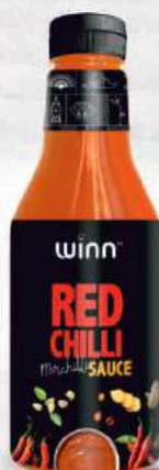
Weight - 310g Type - (PET Bottle)