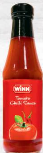
Weight - 340g Type - (Glass Bottle)