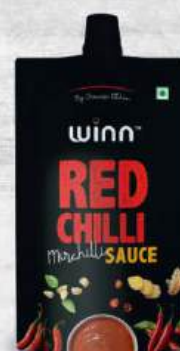
Weight - 100g Type - (Doy Pack)

Label: - Date of manufacture, expiry and batch number will be mentioned on pack. Storage Condition: Ambient / below 35°C for better shelf life Avoid direct sunlight