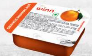
Weight - 15g Type - Blister Pack