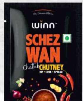
Weight - 10g Type - Sachet