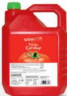
5kg (HDPE Jar)