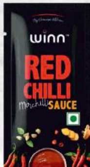
Weight - 8g Type - Sachet