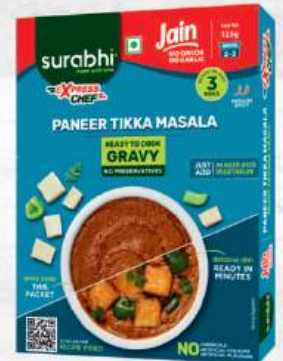
135g Retort Pouch