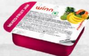
Weight - 15g Type - Blister Pack