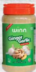
1kg (PET Jar)