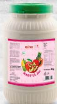
4kg (HDPE Jar)