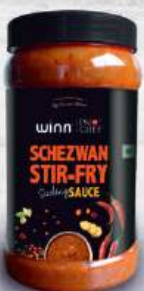
1kg (PET Jar)