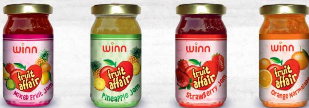
260g (Glass Jar)

Welcome to the delightful world of our Fruit Jam selection, featuring the luscious Mixed, classic Strawberry, tropical Mango, refreshing Orange, and exotic Pineapple variants. Savor the richness of handpicked fruits in every jar, crafted to perfection for a truly indulgent experience. Whether it's the familiar comfort of Strawberry or the tropical allure of Mango and Pineapple, each jar is a burst of natural sweetness. Available in 15g, 100g, 260g, 500g, 1000g and 4.8kg packs, our Fruit Jams cater to various preferences and occasions, adding a touch of fruity delight to your breakfast spread or dessert table.