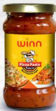
Weight - 300g Type - (Glass Jar)