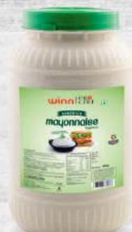
1kg/3.5kg (HDPE Jar)