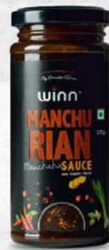
Weight - 275g Type - (Glass Jar)