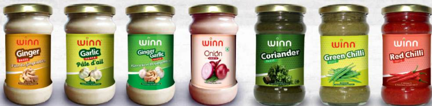
300g (Glass Jar)

The convenience of our Culinary Paste collection, including the aromatic Ginger Garlic Paste, savory Onion Paste, zesty Green Chilli Paste, fiery Red Chilli Paste, and vibrant Coriander Paste. Simplify your cooking experience with our carefully prepared pastes, designed to add a burst of authentic flavor to any dish. Available in 300g and 1kg packs, our Culinary Paste range caters to diverse culinary needs, making meal preparation effortless and enjoyable. Elevate your culinary creations with our premium pastes, ensuring that every dish is infused with the richness of authentic, finely ground ingredients.