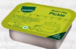
Mixed / Mango pickle