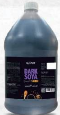
1 Gallon(3.78Ltr) (HDPE Jar)