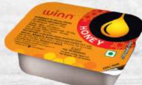
Weight - 15g Type - Blister Pack