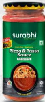
250g (Glass Jar)