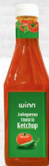
Weight - 680g Type - (PET Bottle)