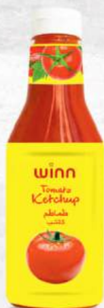
Weight - 340g Type - (PET Bottle)

Our delectable Tomato Ketchup and Tomato Chilli Sauce, the perfect companions for enhancing your culinary creations. Our Tomato Ketchup features a rich, smooth texture with a balanced tangy sweetness, ideal for elevating the flavors of burgers, sandwiches, and more. Meanwhile, our Tomato Chilli Sauce boasts a tantalizing blend of red chillies and ripe tomatoes, adding a fiery kick to your favorite dishes. Available in convenient pack sizes of 200g, 320g, and 340g, our products cater to various cooking needs, whether it's a family meal or a professional kitchen setting. Elevate your dining experience with our premium Tomato Ketchup and Tomato Chilli Sauce, guaranteed to add a burst of flavor to every bite.