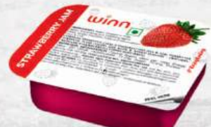
Weight - 15g Type - Blister Pack