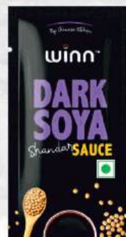
Weight - 8g Type - Sachet