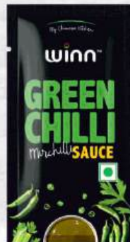
Weight - 8g Type - Sachet