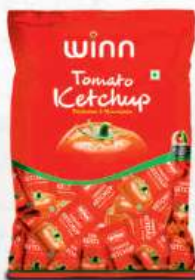
9g(Sachet) x 100 Nos Outer pack