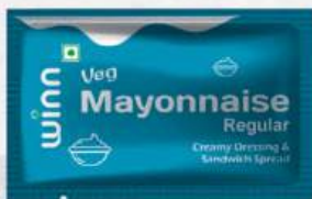
Weight - 10g Type - Sachet