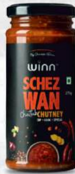
Weight - 275g Type - (Glass Jar)