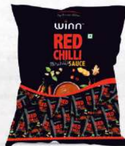
8g & 10g (Sachet) x 100 Nos Outer pack